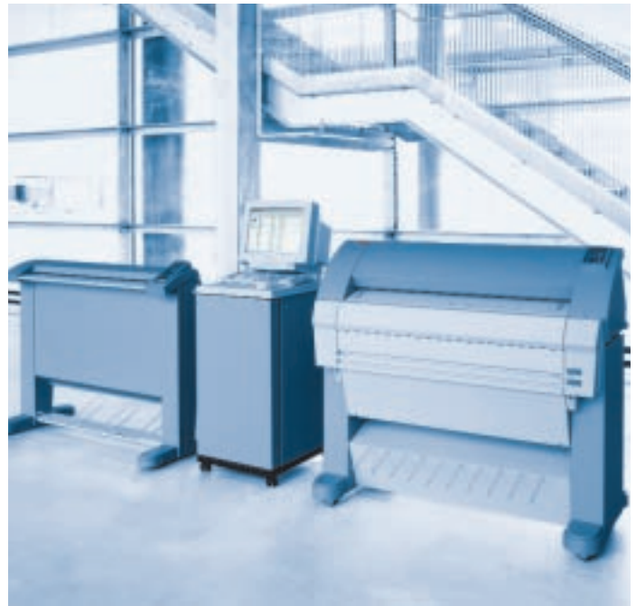
TDS400 Multifunctional system

Applications Océ Scan Manager, integrated scanning solution and Océ View Station LT for viewing Scan destinations 6 programmable destinations Scan to Web via FTP Scan to network directory Scan to controller Resolutions 200, 300, 400 dpi Data formats Tiff (G3, G4, uncompressed) CALS Type 1 Scan modes Single scan, batch scanning with or without checkplot File naming Automatically generate unique file names for each scan, change file names at point of scanning Océ Image Logic® Optimum scan quality with special original modes Optimization Scan quality or file size Ease of use Scan to file from scanner panel, scan directly to destination